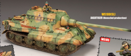
WS180(SL) JAGDTIGER (Henschel production)