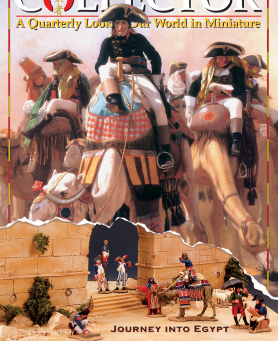
JOURNEY INTO EGYPT

A Quarterly Look at Our World in Miniature