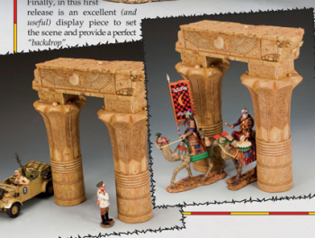
NE012 Temple Ruins

Finally, in this first release is an excellent (and useful) display piece to set the scene and provide a perfect "backdrop".