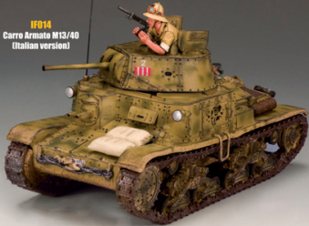
IF014 Carro Armato M13/40 (Italian version)

Italy's entry into the Second World War should have given "Il Duce" some serious pause for thought and a large dose of reality in his dream of establishing a "new Roman Empire".