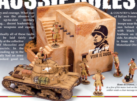
Home decoration... Aussie style.

Seven of our troops wear the tropical sun helmet complete with black cockerel feathers on the right side. An attached officer is from the "Trieste" Motorised Division.