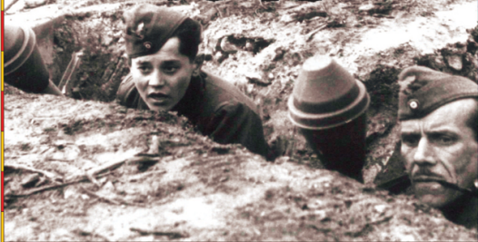
A father and son awaiting the Red Army's advance into Berlin sometime in April 1945.