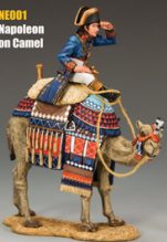
NE001 Napoleon on Camel