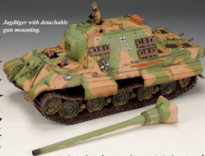
Jagdtiger with detachable gun mounting.

It also uses up precious fuel at an alarming rate and, to make matters worse it breaks down far too often! But for these few remaining "Volkssturm"... its all they've got!