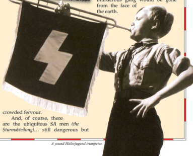
A young Hitlerjugend trumpeter.