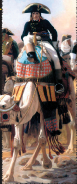
Detail from the Genard painting.

relatively modest and contains just one mounted piece... six foot figures and ... a superb architectural backdrop item.