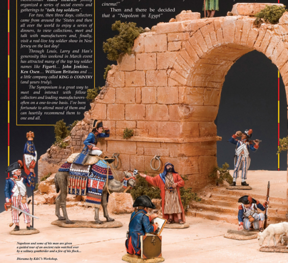
Napoleon and some of his men are given a guided tour of an ancient ruin watched over by a solitary gauthier and a few of his flock...