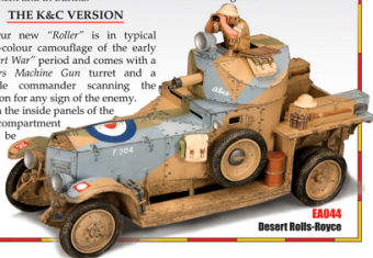
EA044 Desert Rolls-Royce

This vehicle belongs to the famous " 7th Armoured Division " ( The Desert Rats ) and carries a readily identifiable RAF roundel on the bonnet for easy aircraft recognition.