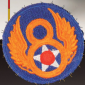
AF012 P47 Thunderbolt

THE P-47 "THUNDERBOLT" had many nicknames... "The Jug"... "T-Bolt"... "Juggernaut" and even a few German ones that were not so polite!