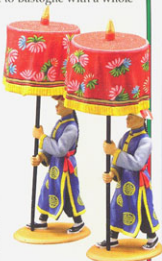
A pair of Canopy Bearers from The new Chinese Wedding Procession.