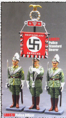
LAH070 Police Officer

At the same time large parts of the country were placed under British and French control—including the industrial heartland of Germany... The Ruhr . A weak central government was installed, which became known as "The Weimar Republic". The old order was dismantled... in