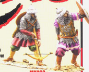
MK033 Saracen Defending w/Sword & Shield

throughout the Middle East. With a huge army of Saracens he besieged Jerusalem itself later that same year. This culminated in the city's fall on October 2, 1187 ending more than 88 years of Crusader occupation.