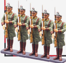
LAH072 Policeman Presenting Arms