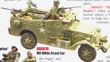
BBA016 M3 White Scout Car

BBA014 "Surprise, surprise." Two German infantrymen stumble across a pair of GI's planting mines. Fortunately for the Yanks they are quicker on