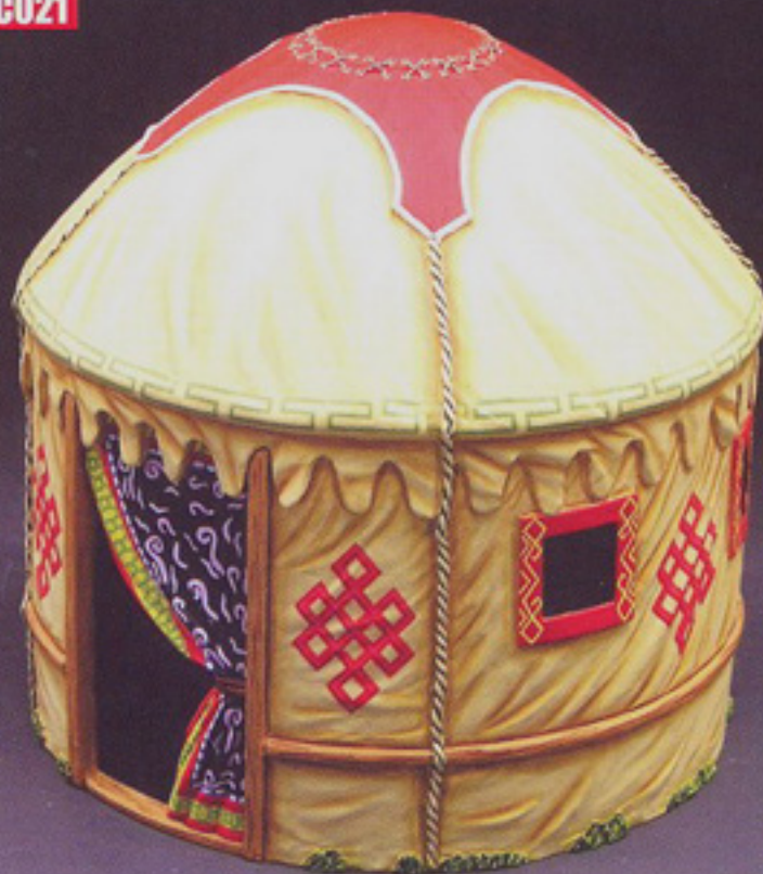
A traditional Mongol tent - one of the upcoming 'Imperial Collection' releases.