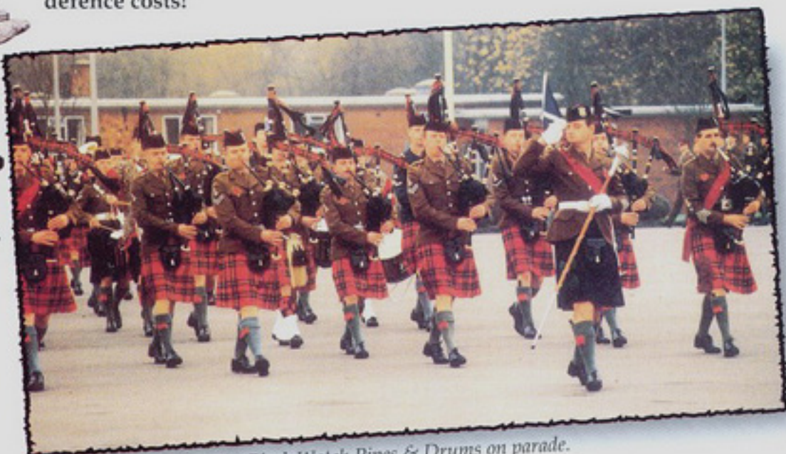
The Black Watch Pipes & Drums on parade.

This, at a time, when our already under-manned and under-funded Army, Navy and Air Force are already stretched with overseas commitments in Iraq, Afghanistan and half-a-dozen other places around the globe. Tony Blair and his political cronies in the British Government are very good at putting British servicemen's lives in danger... they're not very good at providing the money to give them the weapons, the equipment or the numbers required to do the job properly.