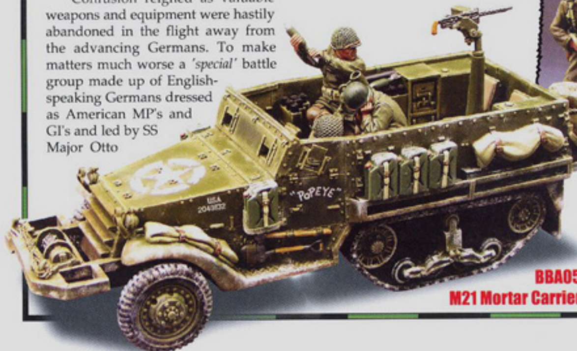
BBA05 M21 Mortar Carrier

BBA05 is our 'M21 Mortar Carrier'. This 81mm tube is mounted on the back of the famous M3 Halftrack. Two GI's man the mortar while the vehicle driver looks on.