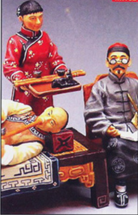
An enlarged section of HK102 "The Opium Smokers" showing some of the fine detail and character in Vicky's painting.