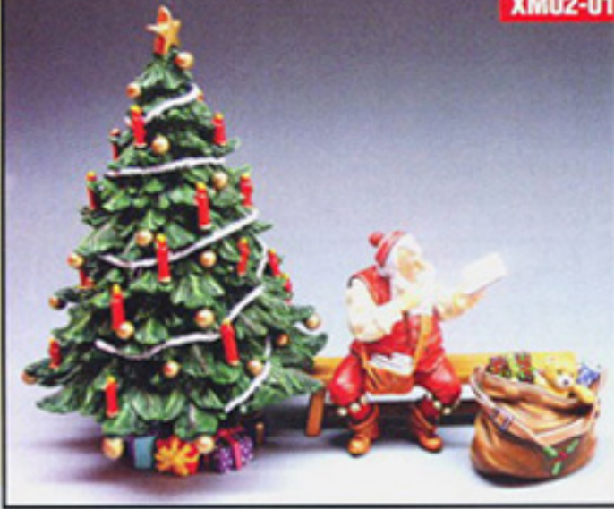
figure or the collector buys sets and figures as gifts for others.

Whatever the reason one of the great symbols of Yuletide is Father Christmas or Santa Claus.