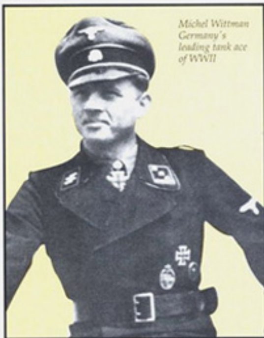
Michel Wittman Germany's leading tank ace of WWII

TIGER #5 is, without doubt, the best yet. We've decided to make another Tiger associated with Michel Wittman, the legendary tank ace. This time, most poignantly, his last Tiger, hull number 007. This was the vehicle he was in when leading a troop of Tigers in a counter attack on Allied armour in Normandy on August 8, 1944.