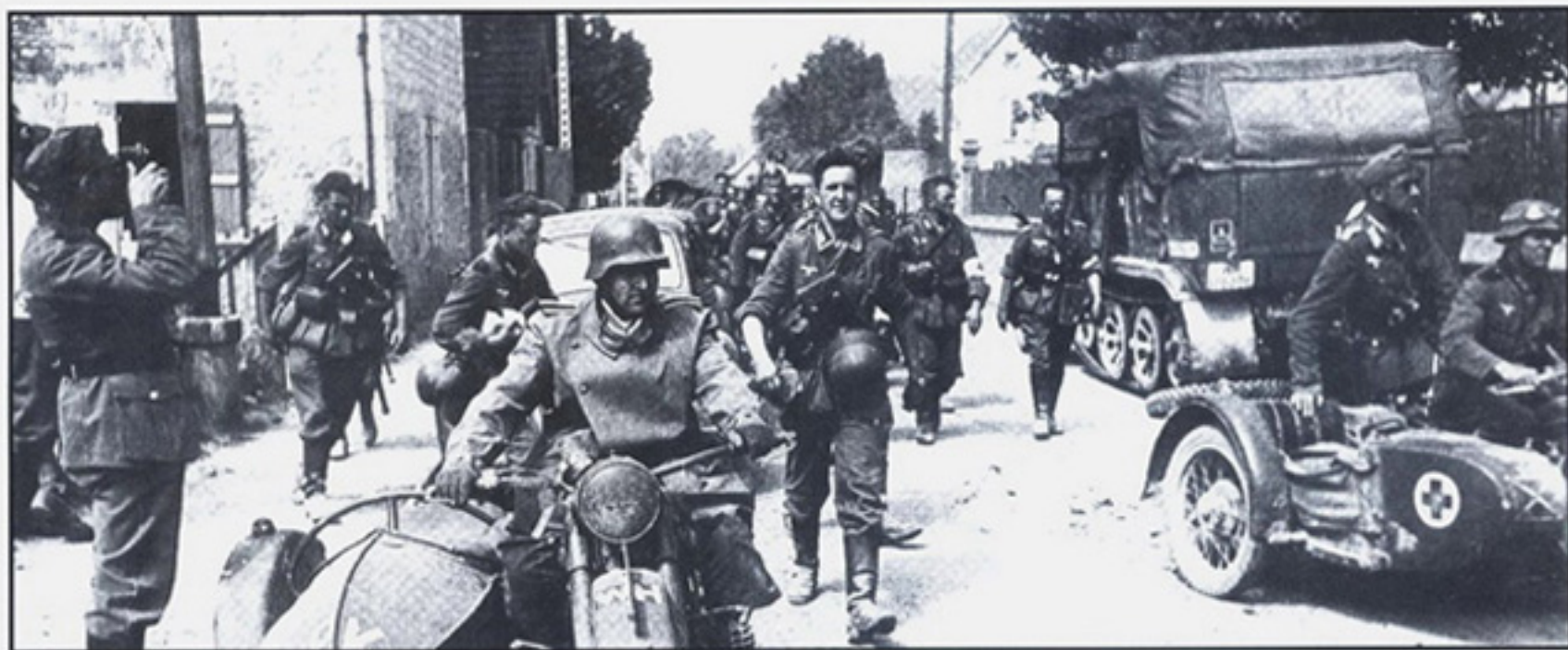
Somewhere in France, June 1940