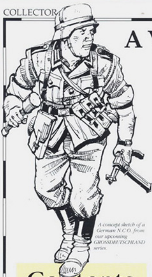
A concept sketch of a German N.C.O. from our upcoming GROSSDEUTSCHLAND series.